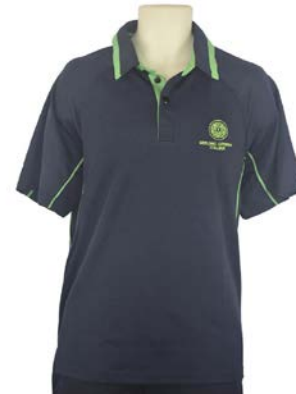
House Polo SJ - Higgins AC - Fairhaven