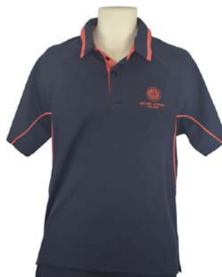
House Polo SJ - Parkes AC - Breamlea