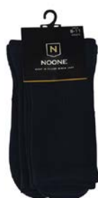
Cushioned Navy Sports Socks