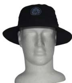
Bucket hat (Prep - Year 12)