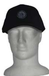
Cap (Year 7 - Year 12)