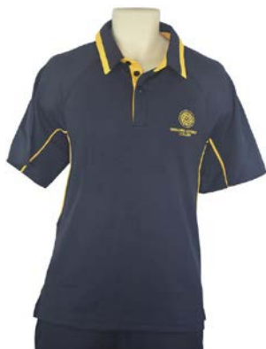
House Polo SJ - Deakin AC - Torquay