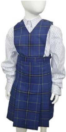
Tunic (Year 2 - Year 4)