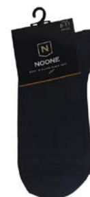
Navy socks over ankle