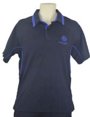
House Polo SJ - Barton AC - Angelsea