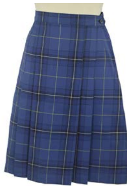
Kilt (Year 5 - Year 12)